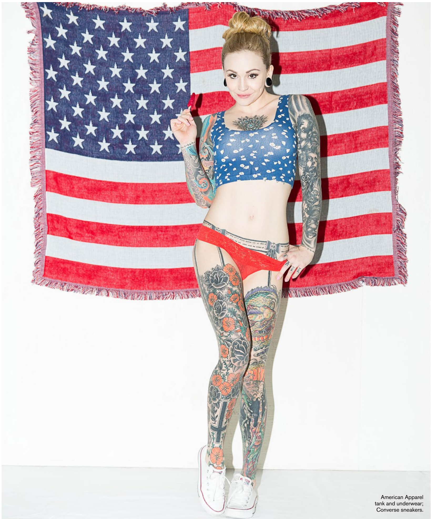
American Apparel tank and underwear; Converse sneakers.