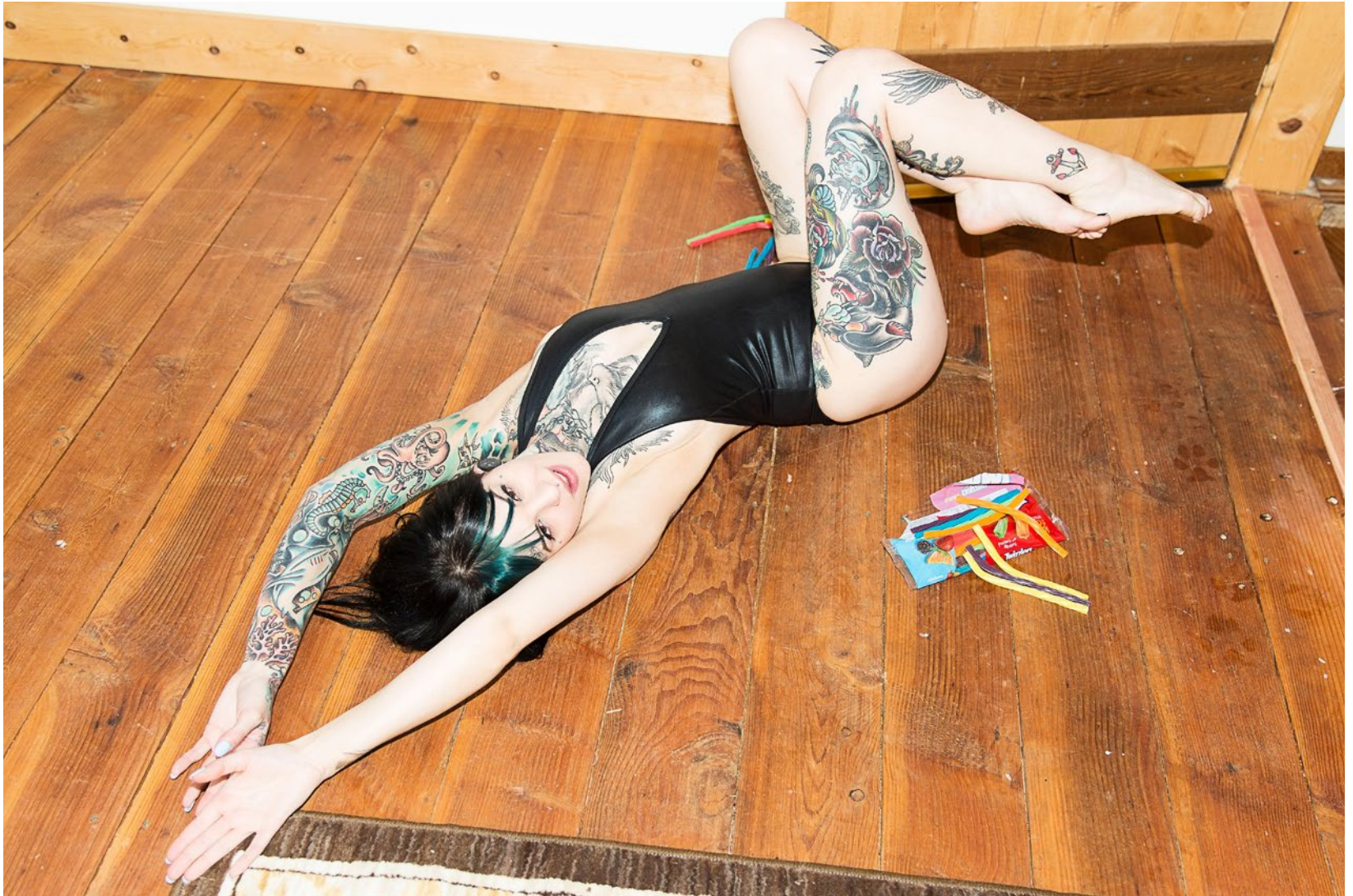
American Apparel bodysuit.