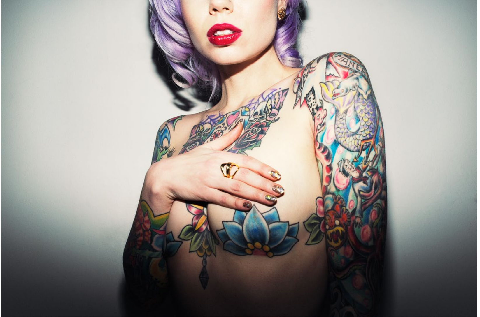
Maria Black ring